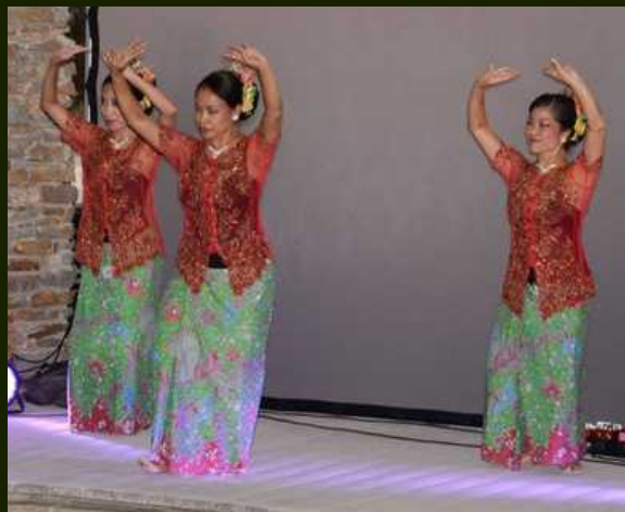
The beauty of Indonesian dancers at a previous annual Pongo Awards and benefit event in Southern California. We plan to have traditional gamelan and dancing at our November 13th Gala.