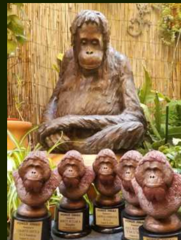
Who will be this year's Pongo Environmental Award recipients? The list of awardees will be announced approximately one month before the event.

Attendees will enjoy Indonesian food & entertainment and bid on exclusive items at the silent & live auctions. The presentation, including the Pongo Awards, will be Livestreamed for those who cannot attend. While restrictions for in-person gatherings are being relaxed, attendance will be limited according to safety protocols by the Consulate office.