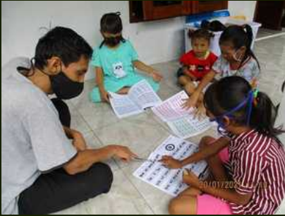
CECP educator provides reading lessons to children in remote village near Gunung Leuser National Park

The Orang Utan Republik Foundation's annual benefit helps to provide funding for its operations and signature programs: the Community Education and Conservation Program (CECP) and the Orangutan Caring Scholarship program (OCS).