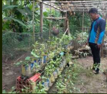
CECP funded nursery helps locals plant trees in the buffer zone around Gunung Leuser National Park