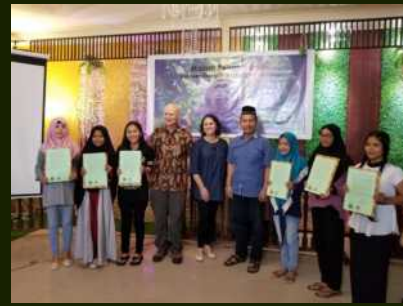
OCS program provides university scholarships in the fields of biology, forestry & veterinary science in orangutan range provinces on Sumatra & Borneo. Over 200 have been given since 2006.

OURF is honored to have its annual benefit supported by Consulate General of the Republic of Indonesia at the newly remodeled Consulate General building in Los Angeles including its spacious event auditorium.